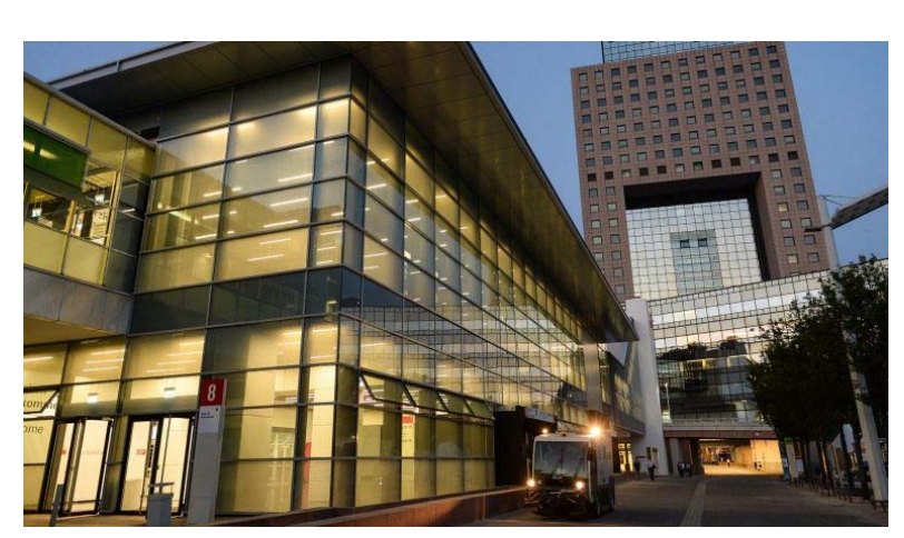
The new entrance to Hall 8

The most important travel information and tips for spending time in Frankfurt can be found on the internet at: <a href="www.iffa.com/arrival">www.iffa.com/arrival</a>